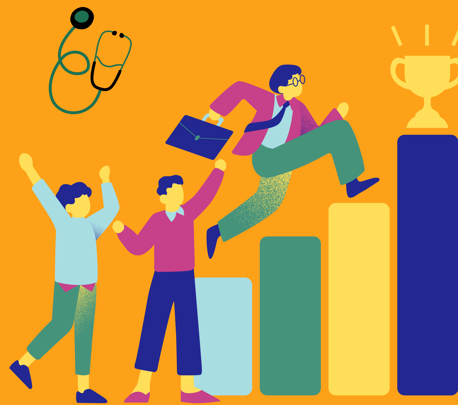
How supported in your future career goals did you feel by UCI faculty and staff OUTSIDE of vs. WITHIN the HELIOS lab?